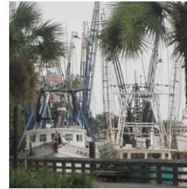
Happy Labor Day!

OUR ARCHIVES/LIBRARY BUILDING, ON THE GROUNDS OF FORT KING GEORGE HISTORIC SITE, IS OPEN EVERY THURSDAY FROM 11:00 A.M. TO 3:00 P.M.